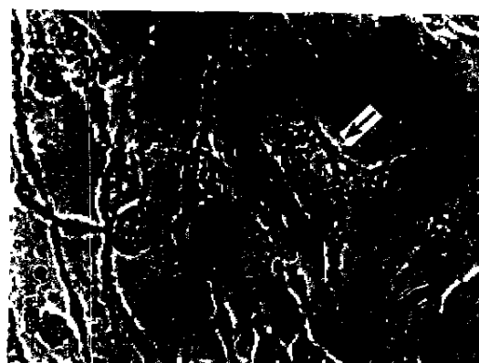
Fig 1. Cultured cortical neurons (←).

junction was nullified with an offset circuit before the formation of gigaseals. Currents were lowpass filtered at 1 kHz. The data were analyzed using an IBM computer with the clamp software.